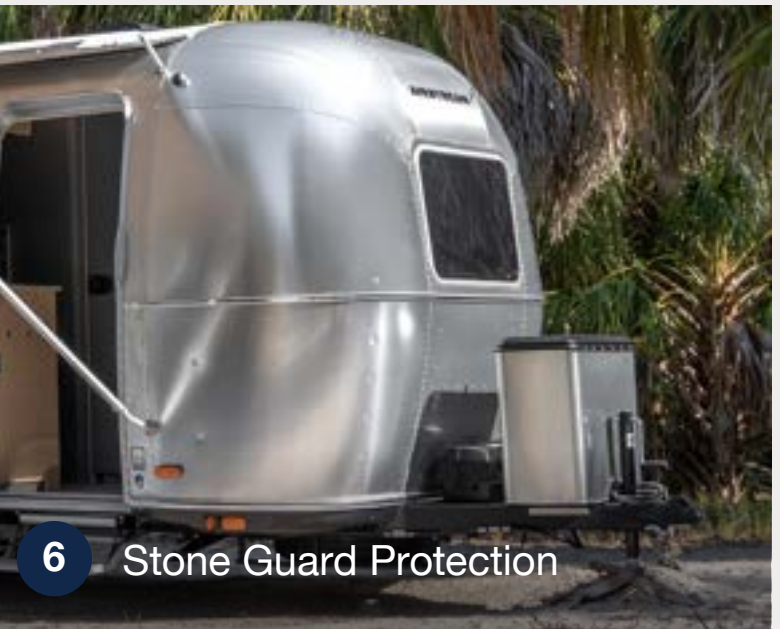
6 Stone Guard Protection