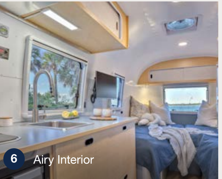
6 Airy Interior Light laminates, terrazzo-inspired vinyl flooring and white walls create an expansive feel