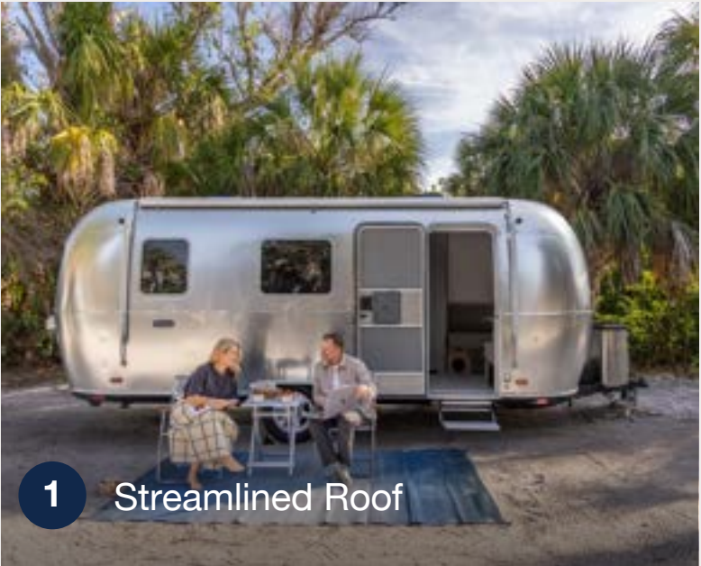
1 Streamlined Roof

A/C moves under roadside bed for a clean silhouette