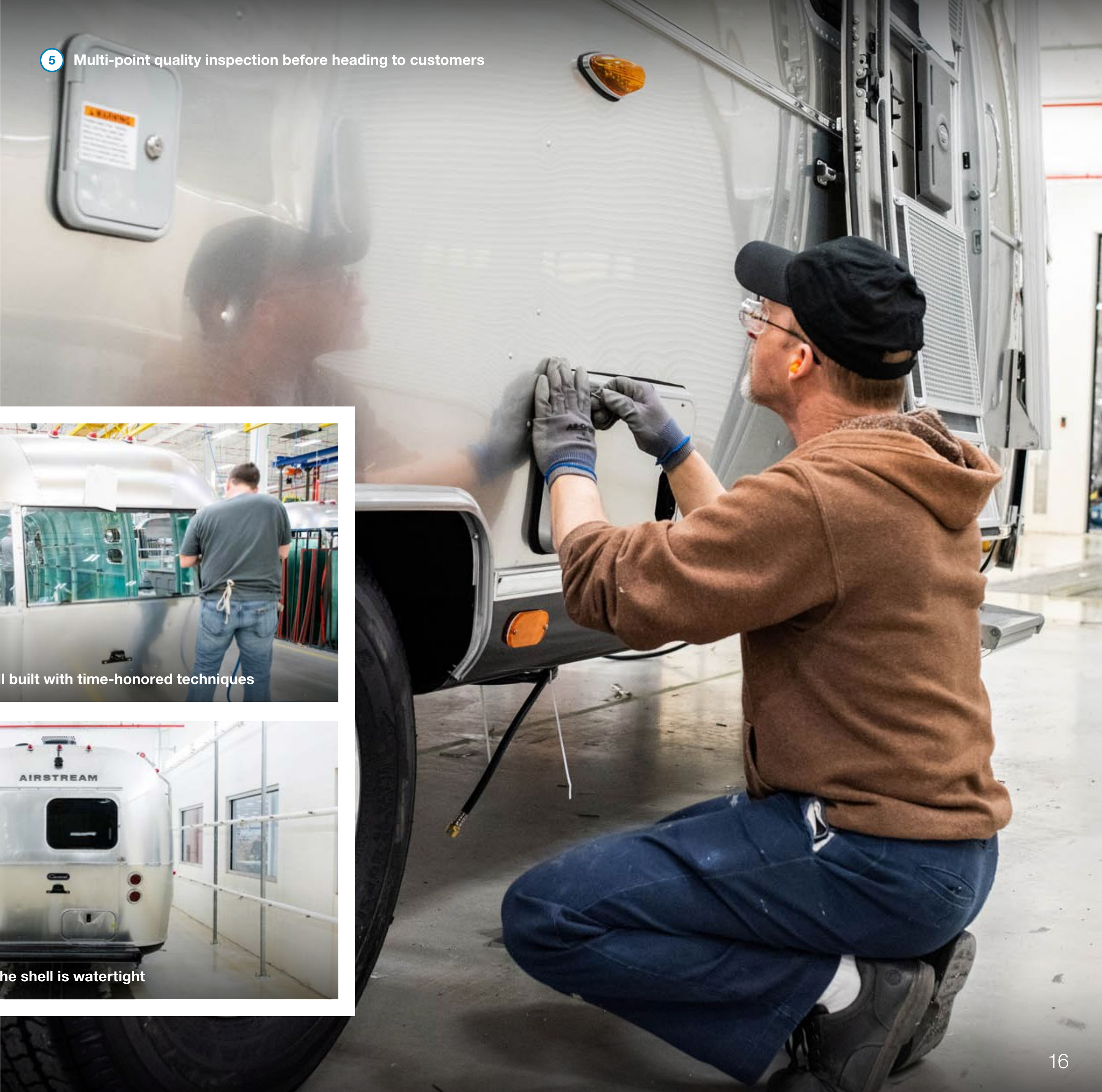
5 Multi-point quality inspection before heading to customers