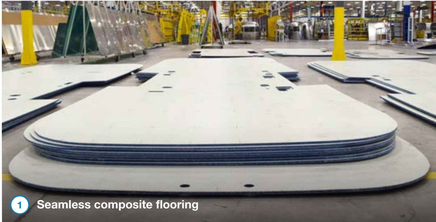
1 Seamless composite flooring