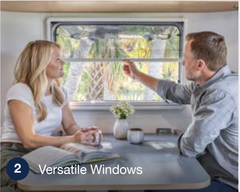
2 Versatile Windows Screens, blackout blinds, or open to the world