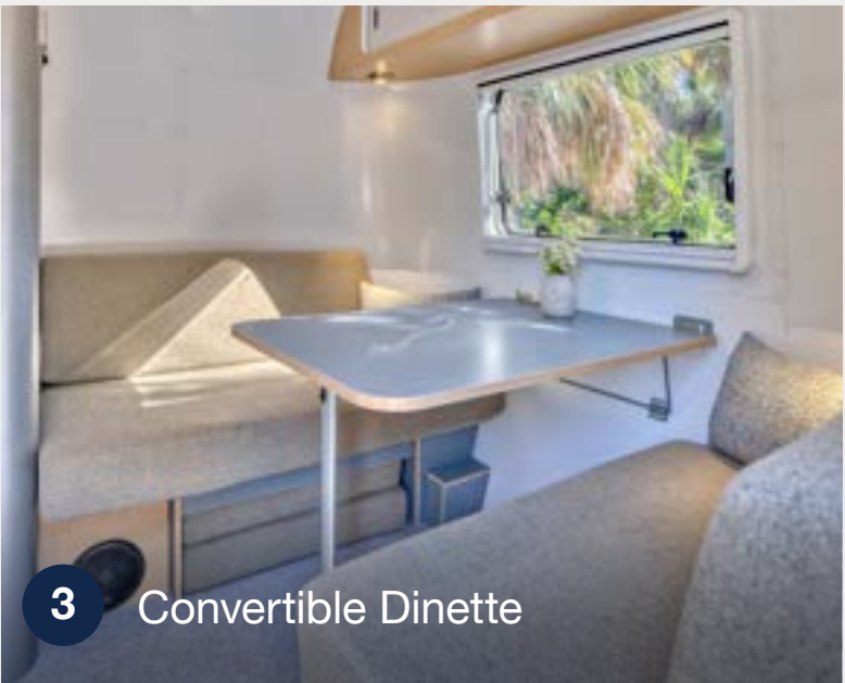
3 Convertible Dinette Dine at the table, or set up for sleeping or lounging in style