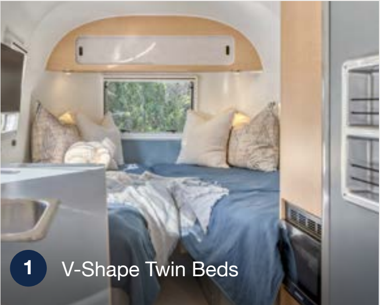
1 V-Shape Twin Beds Notched bed creates more space to move