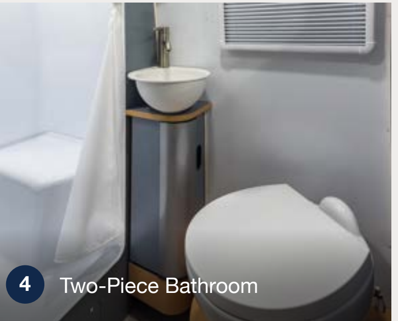
4 Two-Piece Bathroom Dedicated spaces for shower, lavvy sink and fully plumbed toilet