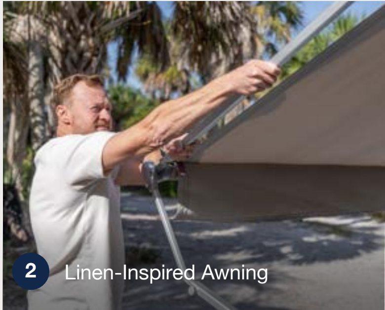
2 Linen-Inspired Awning

A/C moves under roadside bed for a clean silhouette