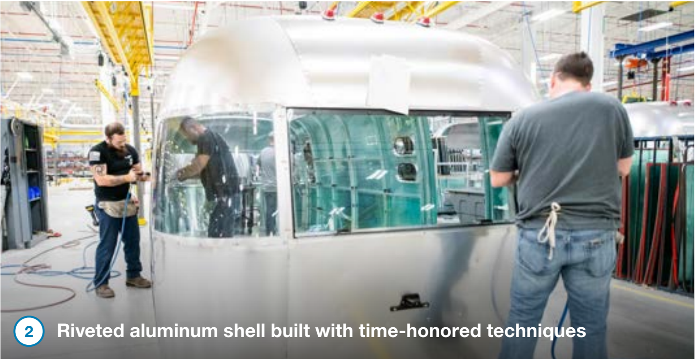
2 Riveted aluminum shell built with time-honored techniques