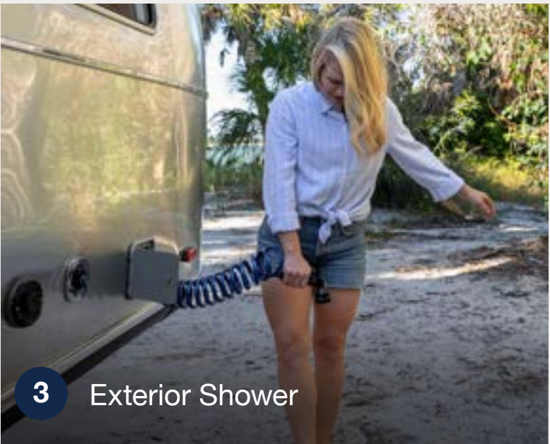
3 Exterior Shower

Manual Zip-Dee awning creates wide foot-print for exterior patio space