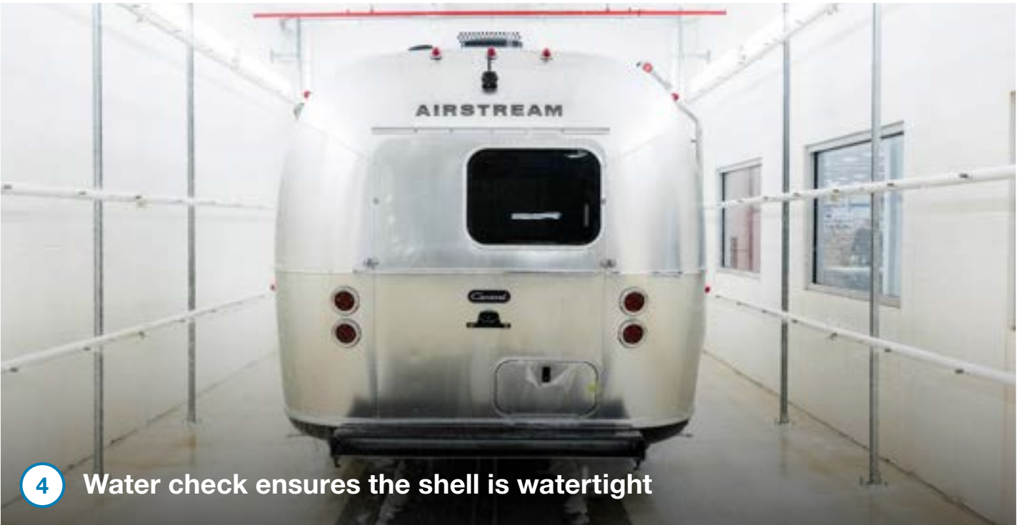
4 Water check ensures the shell is watertight