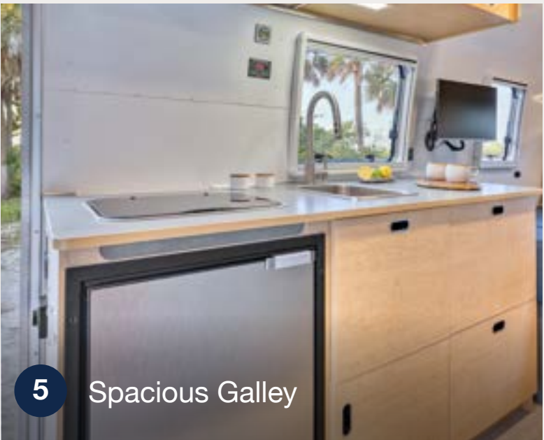
5 Spacious Galley 12 V refrigerator, sink, two-burner gas cooktop, and plenty of space to meal-prep