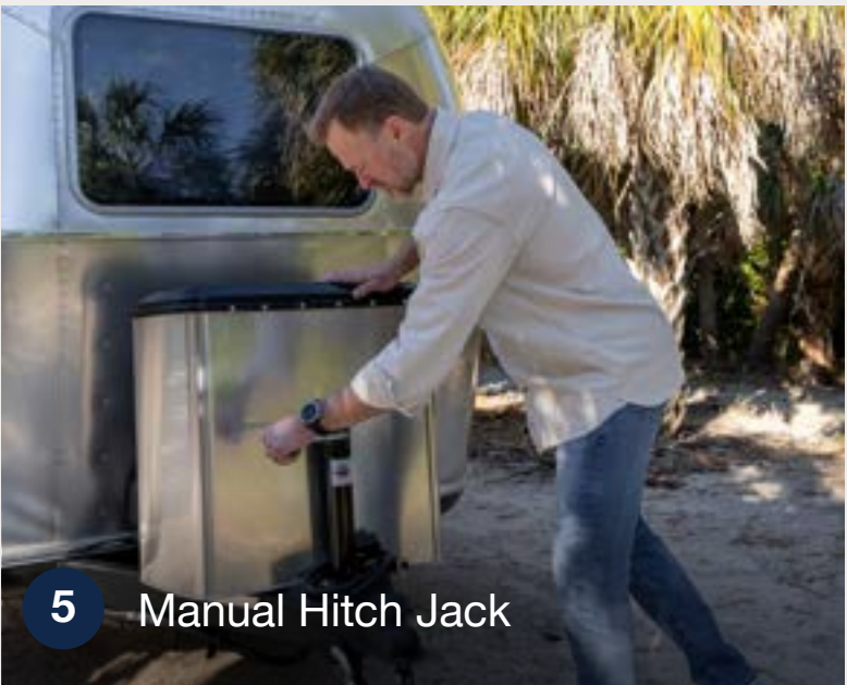
5 Manual Hitch Jack