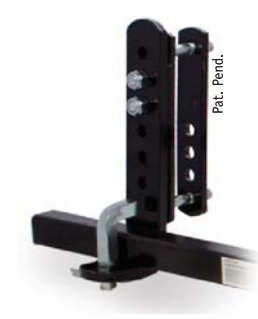
Equal-i-zer's superior rigid trailer bracket assembly.

The Equal-i-zer hitch's rigid bracket design provides two of the Integrated friction Sway Control points. Rigid brackets eliminate the pendulum effect caused by chains that can actually make sway worse! The rigid brackets are stable, and can ease the anxiety caused by weaving down the highway.