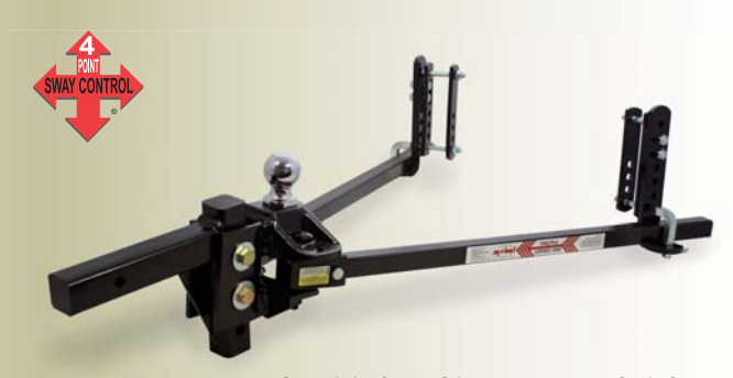
The Original Equal-i-zer Sway Control Hitch gives you superior performance and safety with Integrated Sway Control.™

Because your safety is too important to trust anything but the best